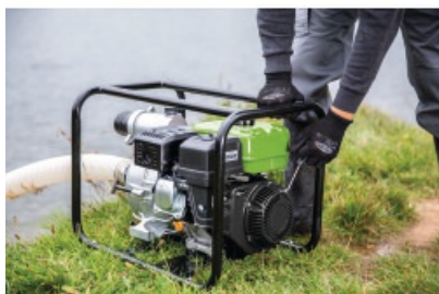
Illustration shows accessory suction hose

4-stroke engine with recoil starter: easy to start in all conditions