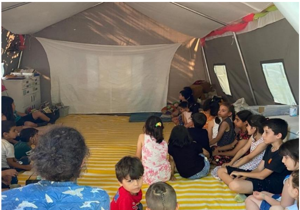
Children inside the new activity tent