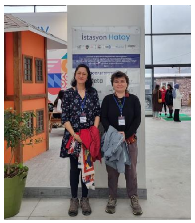
Hatay Gençlerle Sanat İnisiyatifi Team