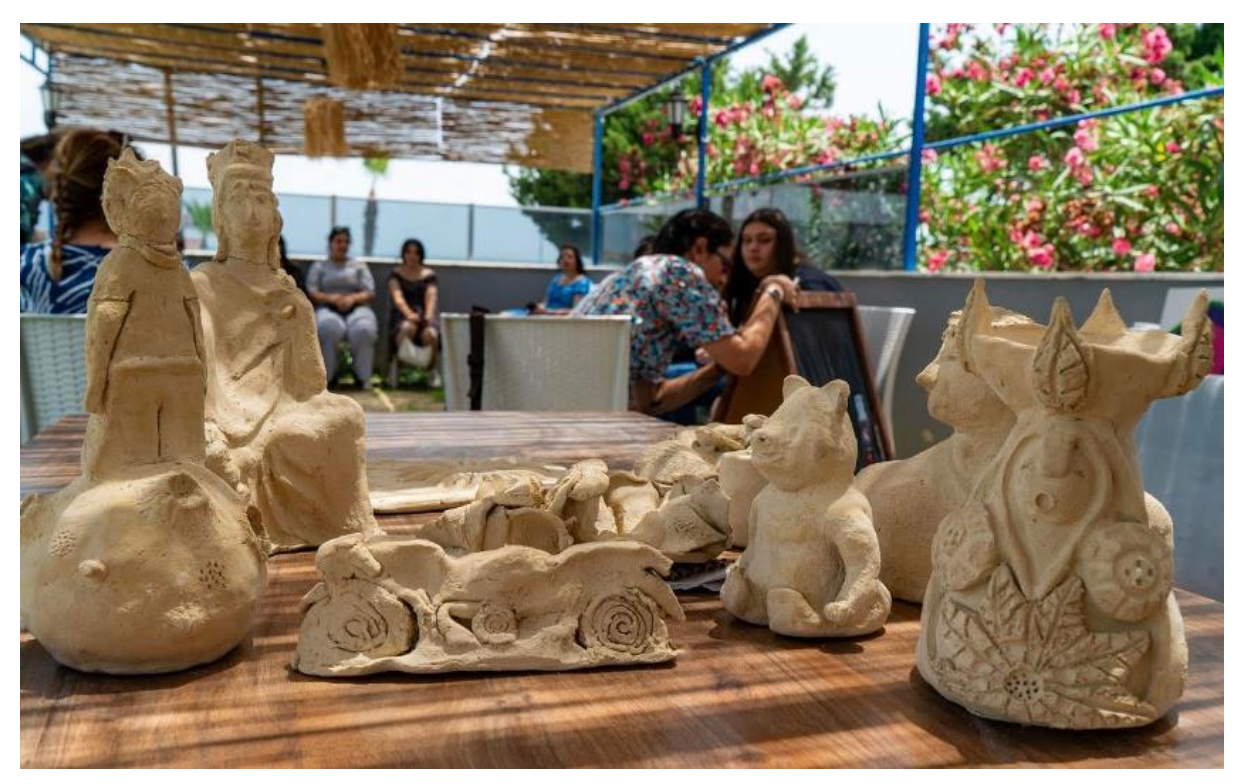
Artworks created by local youth attending the project with the assistance of local artists