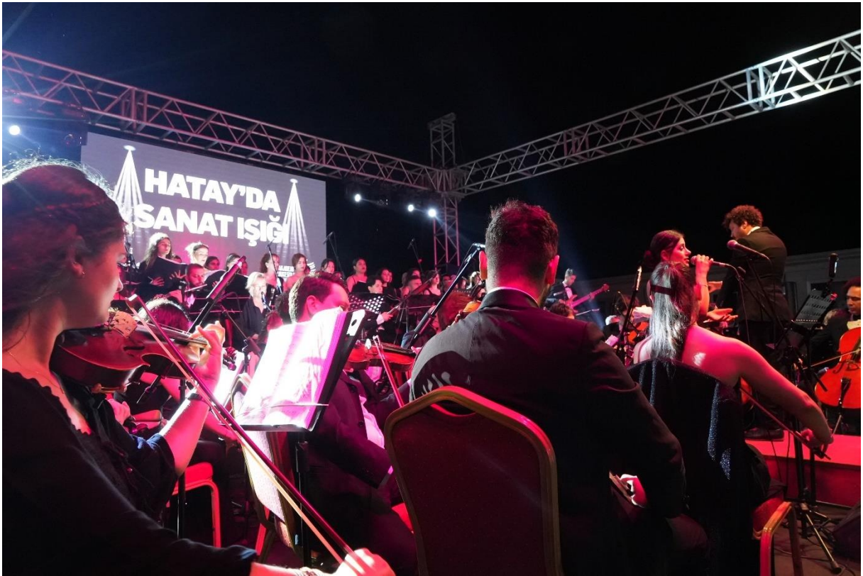
Impressions from Hatay Akademi Senfoni Orkestrası's first concert in Antakya after the earthquake, 1st of June, 2024