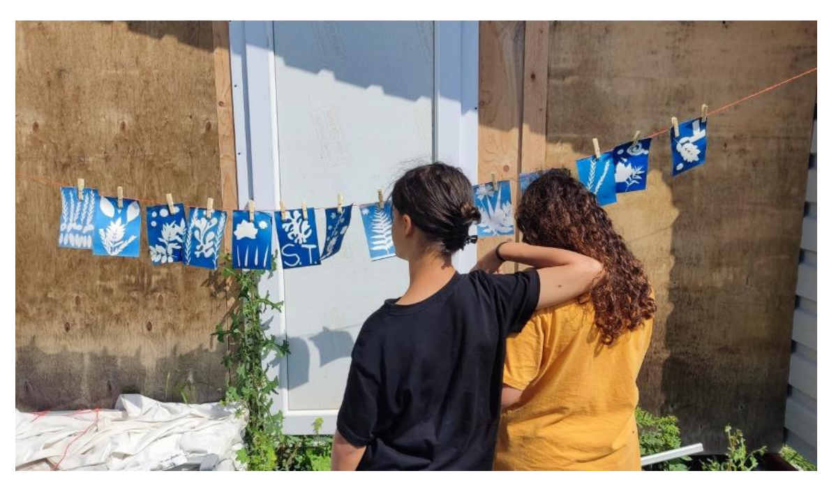
One the workshop outputs of Beytna's project from Bahçeköy, Antakya.

The target audience of the events is primarily children and adolescents aged 8+, and secondarily adults. We are planning to visit villages and neighborhoods outside the city center of Antakya and we are working with local initiatives, local offices and associations for this. The Beytna Collective will operate using the extensive local communication network we have established with dozens of villages and neighborhoods through the events we have organized intensively over the past year. To introduce children and young people to various branches of art to which access is very limited outside the big cities, to open the door to artistic creation and to help them gain self-confidence by giving them their first products in these fields. In addition to their function as a form of art therapy, the events also create environments where young people can socialize and engage in joint production with their peers. The closed workshops, some of which last for a full day or twothree days, will produce short films, animations, VR videos or other products that will be shared with the children and on social media. Parents will be introduced to examples of quality cinema outside the mainstream (art cinema, documentaries, animation, etc.) We believe that the events, which will be held in cooperation with local initiatives and institutions, will also fill an important gap for children and young people in Antakya, whose socializing spaces and opportunities have disappeared.