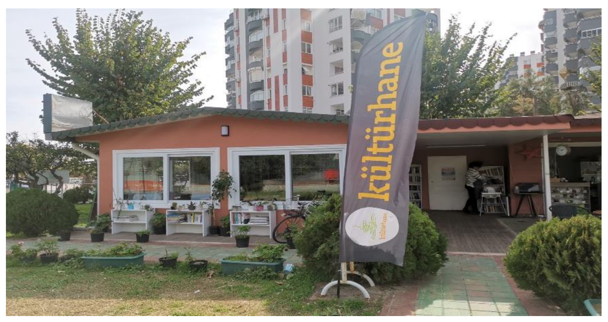
Kültürhane Office in Mersin.

earthquake victims will increase their problem-solving capacity and perhaps have the opportunity to earn an income over time. The repair workshops that will be recorded will later be made available online to those interested. The project will take place in Hatay-Serinyol, which suffered great destruction in the earthquake.