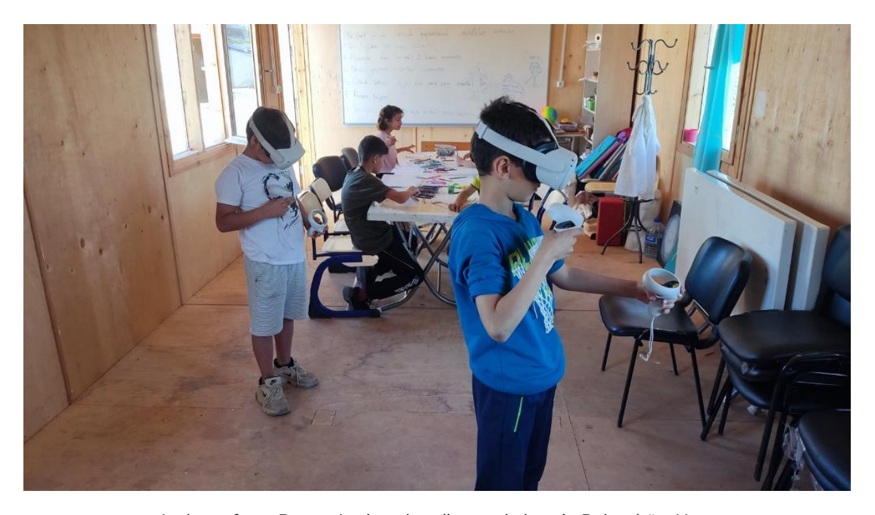
A photo from Beytna's virtual reality workshop in Bahçeköy, Hatay