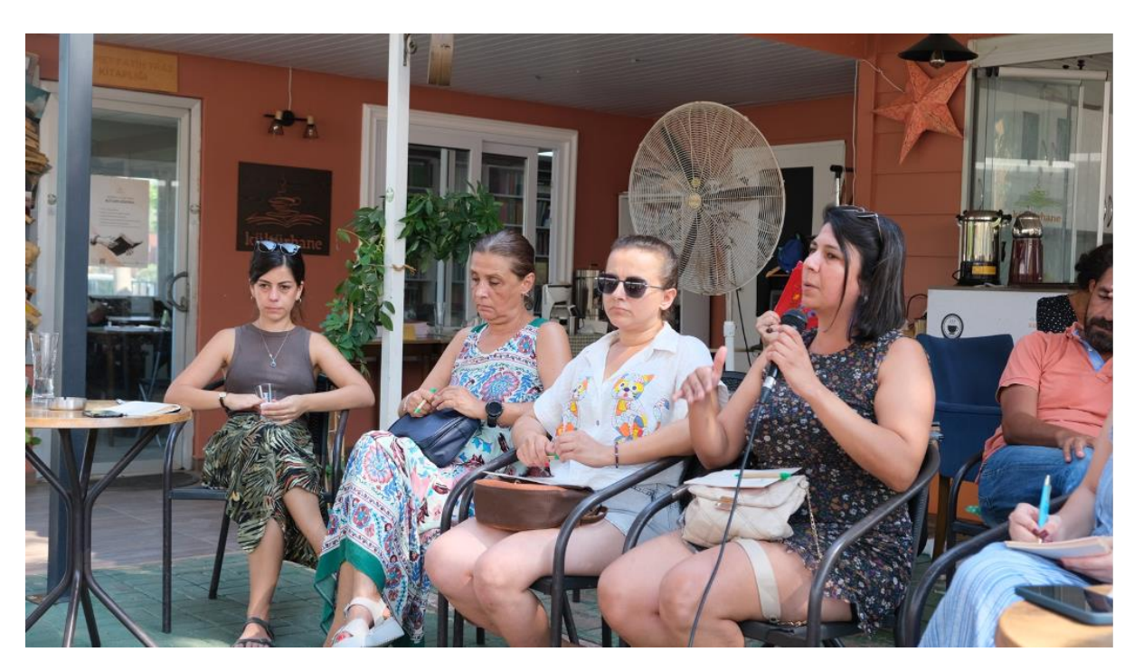
Rimmen&Deprem Dayanışma team at the meeting in Mersin, Kültürhane. Aug 11,2024.