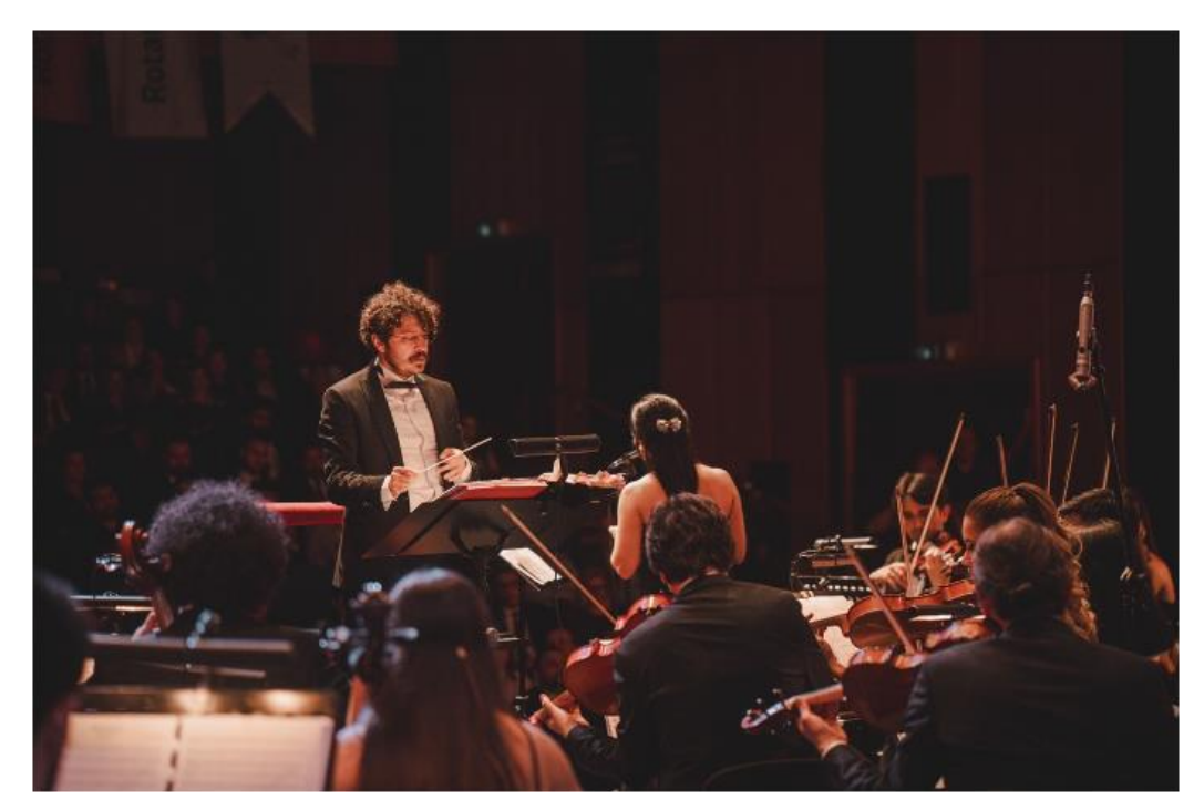
Hatay Akademi Senfoni Orkestrası

This initiative aims to reinstate cultural and artistic involvement among musicians in the city, thereby allowing them to actively contribute to the cultural and artistic landscape. Simultaneously, it endeavors to extend the sphere of cultural and artistic experiences to the residents of container cities, ensuring their right to access culture and the arts. By integrating musicians affected by the earthquake as active contributors to the musical production process, the project aspires to harness the therapeutic potential of art, bringing solace and cultural enrichment to thousands of individuals in the earthquake-stricken region.