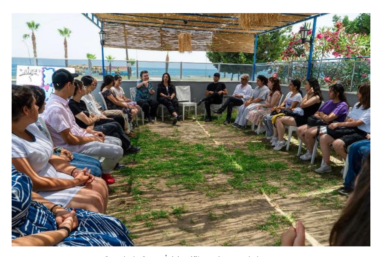
Gençlerle Sanat İnisiyatifi's project workshop