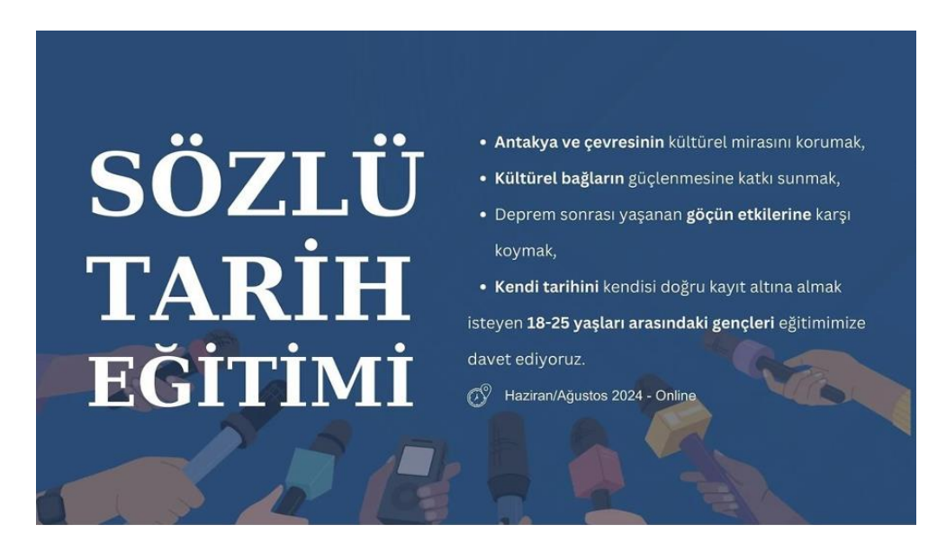
Nehna's project call