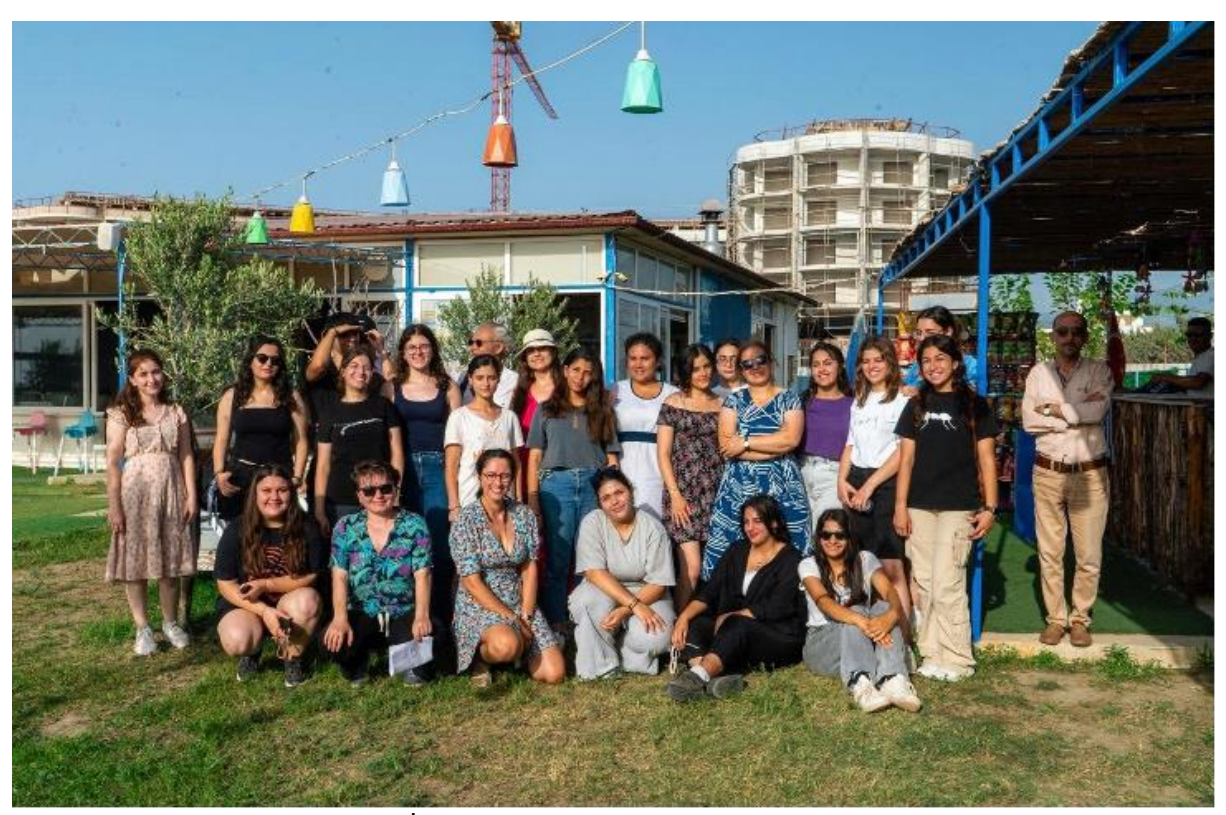
Gençlerle Sanat İnisiyatifi's project meeting with local youth