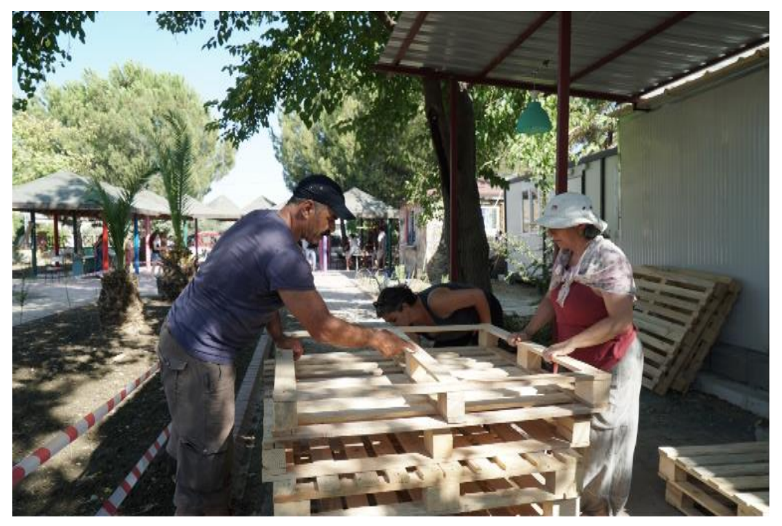
Kültürhane's workshop in Serinyol, Hatay.