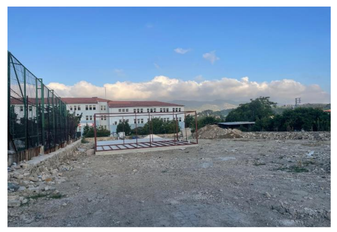
Photos from the common area that has started to be built in Samandağ within the scope of the joint project of Rimmen&Deprem Dayanışma Derneği. Many containers will be placed in the area, and it will be a safe living center for women and children.