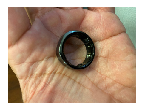
This is my Oura® ring.