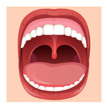
And floor of the mouth to pull the tongue forward by supporting the muscles that have weakened and allow the tongue to collapse in the airway: