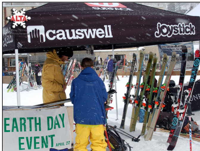
Alta Earth Day – April 13, 2012