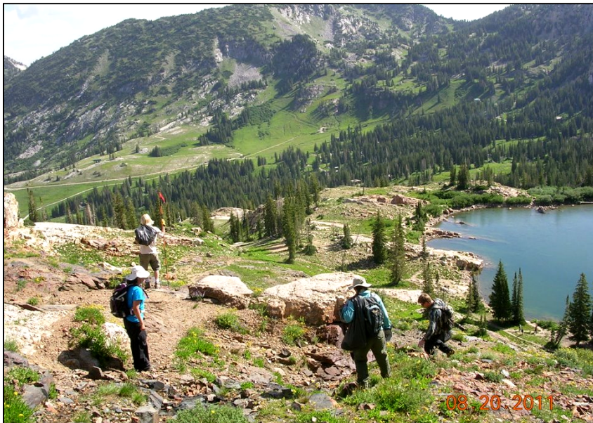
2011 Alta Ski Area Trash Clean-Up

Want to hang out in Alta in the summer? Come help take care of the environmental health of your favorite ski area out at any of the following events: