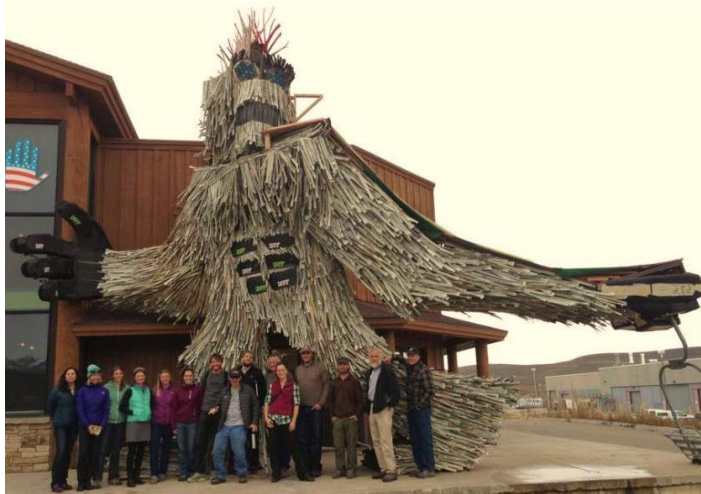
November 7, 2013 Green Team Field Trip to RAMP Sports – Yeti made from ski scraps, just one of many art exhibits at RAMP.

Team Kick-Off Field Trip to inspire and inform our team of how one's commitment to sustainability will benefit, protect and improve our environment ski industry and community. Visiting our ski partner RAMP Sports and our glass recycler Momentum Recycling showed us that sustainability is challenging, but can be done to be economically, socially and environmentally responsible. The final product is skiing some sweet local boards at Alta and knowing that your après beverage bottle is being recycled responsibly.