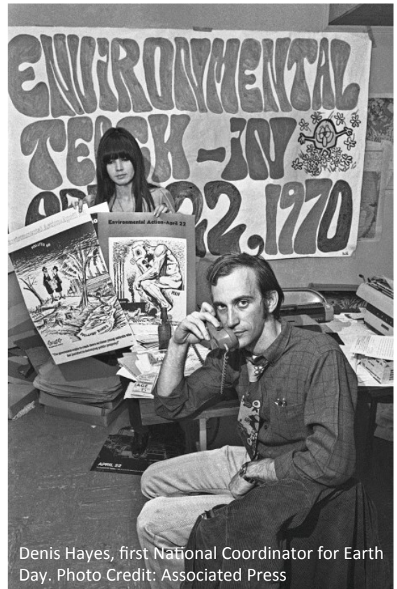
Denis Hayes, first National Coordinator for Earth Day.

On April 22nd, 1970, 20 million Americans mobilized in public forums across the country to rally for a healthy, sustainable environment. Thousands of college students came together to organize protests on their campuses, decrying the deterioration of the environment. The first Earth Day received support from both Republicans and Democrats, and led to the creation of the United States Environmental Protection Agency and the passage of the Clean Air , Clean Water , and Endangered Species Acts. In 1990, Earth Day went global, enlisting support from 200 million people in 141 countries, increasing worldwide awareness of environmental issues and boosting international recycling efforts. In 1995, President Bill Clinton awarded Senator Nelson the Presidential Medal of Freedom—the highest honor given to civilians in the United States—for his role as Earth Day founder.