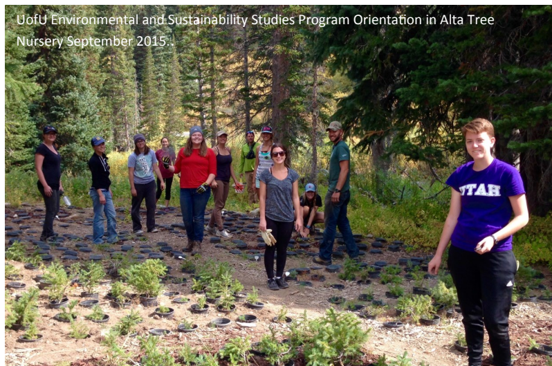
UofU Environmental and Sustainability Studies Program Orientation in Alta Tree Nursery September 2015