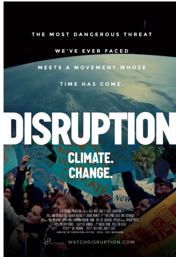
2015 Alta Earth Day Poster Design by Colleen Shea.