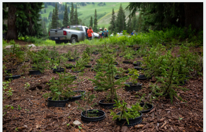
Trees that have been removed from groomed runs sit in our tree nursery near the Albion Meadows trail. It is maintained by TreeUtah and the AEC.

In addition to growing native plants from seed, the AEC partners with non-profit group, TreeUtah, to salvage saplings that are growing in the middle of groomed ski runs. During the summer, volunteers head out on the hill to help us find these small trees, carefully remove them with their roots, and put them into the AEC's onsite tree nursery. Here, they will wait for about a month or so before we plant them into safer places on the mountain. Trees that grow naturally in the middle of groomed ski runs don't have much of a chance once they reach a few feet in height - they will be crushed by grooming equipment. Our goal is to save some of these trees and hopefully give them a much better chance of survival elsewhere. Thank you to TreeUtah for their expertise and guidance in this effort!