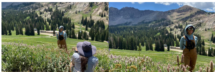
Designated photography pullouts along Albion Meadows allow you to get the shot while conserving the wildflowers for future visitors.

Recreation in the Albion Basin has seen substantial increase over the last couple years, and for good reason: The beauty of the wildflowers that bloom at the top of Little Cottonwood Canyon is one the most incredible seasonal transformations that occur in the Wasatch. But, this increase in visitation comes with a price - unfortunately, it is coming at the price of the wildflowers themselves. Those looking for the perfect photo amongst the flowers are