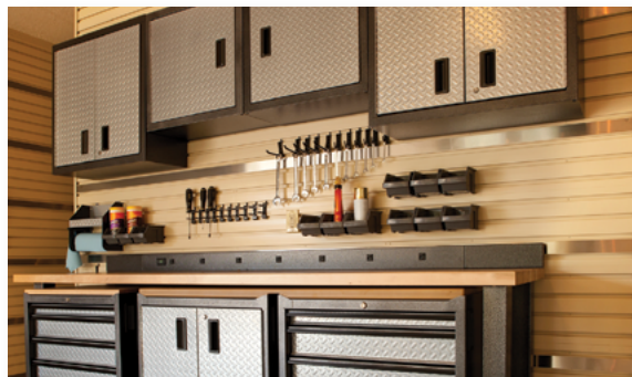
Residential and Industrial Storage