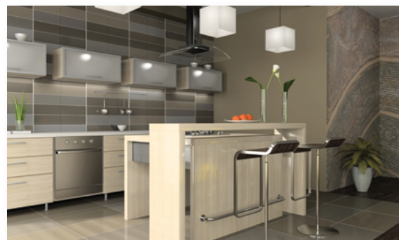
Residential and Commercial Kitchens