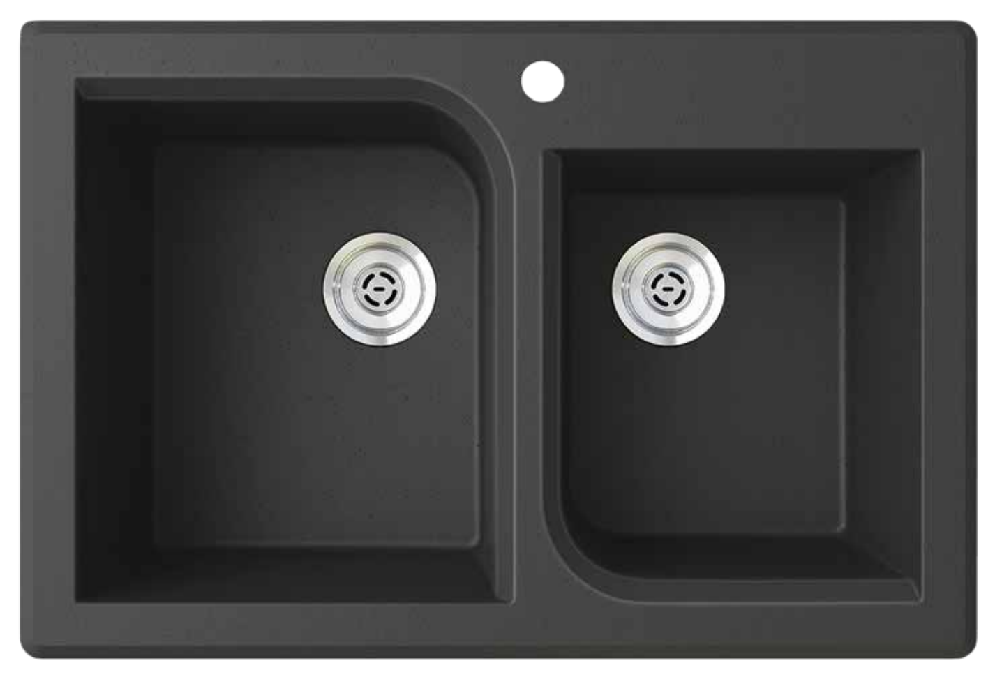
Asymmetrical, sweeping bevels and tight corner radii make these sinks truly unique.