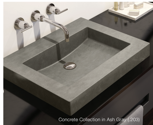
Concrete Collection in Ash Gray (.203)

The color and texture are consistent throughout with no surface coating to chip or crack. Solid Surface also has the best impact resistance testing in the cast polymer industry, up to five times stronger!