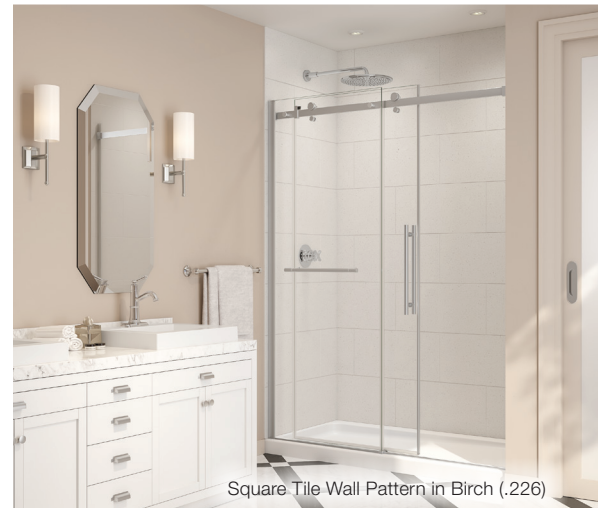
Square Tile Wall Pattern in Birch (.226)

Covered by an industry leading 15 Year Warranty