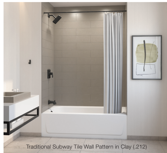
Traditional Subway Tile Wall Pattern in Clay (.212)

Learn more about ABG Hospitality superior offering of Solid Surface kitchen, bath and utility products that are designed to fit any space and last a lifetime.