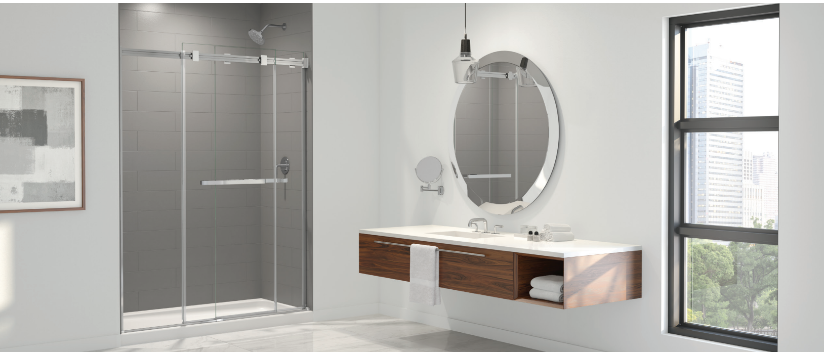
Concrete Collection in Ash Gray (.203)