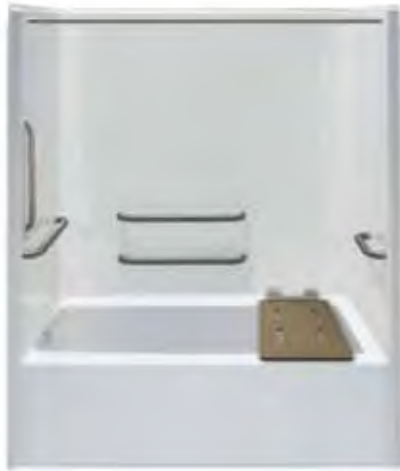
Photograph Illustrates Package One - Handed by Valve Wall Left