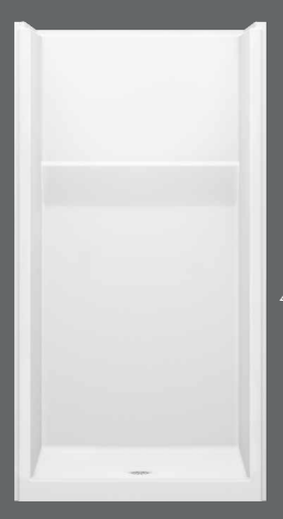
13636FHARRF 36 X 36 X 77 1/4 Ext. Dimensions 41 1/2 X 39 1/4 x 79 Approx. 90 lb

Classic smooth wall shower with dual return flanges, featuring ample storage space