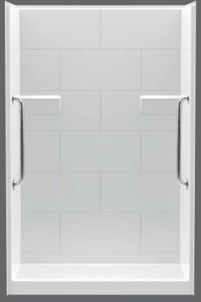
14836ST 48 X 36 X 77 Ext. Dimensions 50 X 38 × 79 Approx. 120 lb

Unique contemporary design that moves away from an institutional look