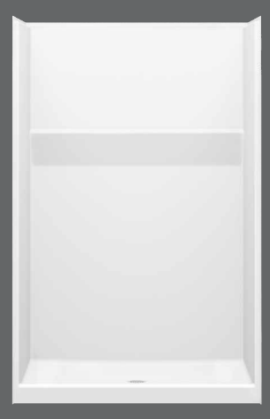
14836FHA 48 X 36 X 77 ¼ Ext. Dimensions 50 % X 38 % x 79 Approx. 110 lb

Smooth wall and shelving that runs along the back wall provide a clean and sleek look to any bathroor