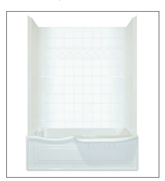
CHA 6034 TS 60''L × 32''W × 87''H Enclosure: N/A