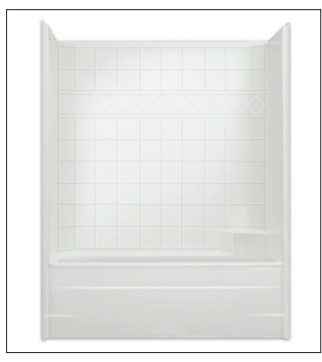
CHM 6032 TS 60"L × 33"W × 76.5"H Enclosure: N/A