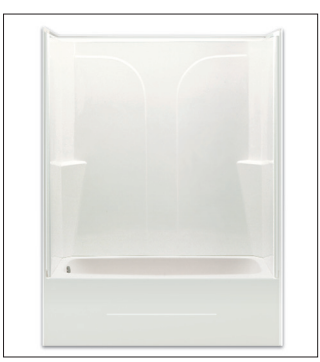
CHG 5494 TS 2P 54"L × 27.25"W × 72"H Enclosure: up to 50.625" × 56"