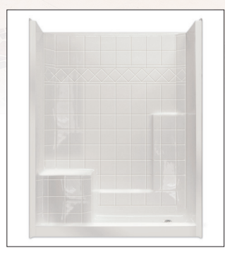
CHM 6036 SH 60"L × 36"W × 77"H Enclosure: up to 55.75" × 71"