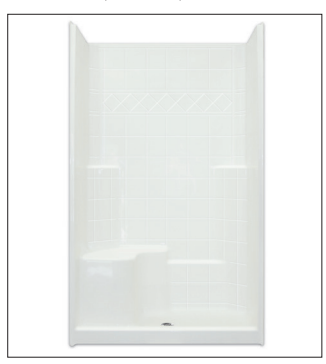
CHM 3648 SH 48"L × 37"W × 80"H Enclosure: up to 45" × 74"