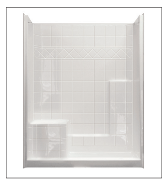
CHM 6032 SH IS 3P 60"L × 33"W × 77"H Enclosure: up to 55.75" × 71"