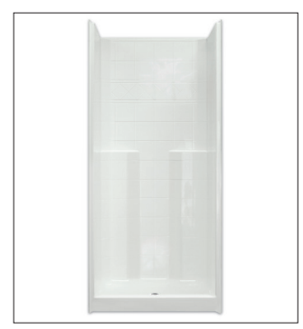
CHM 3678 SH 36"L × 36"W × 80"H Enclosure: up to 33" × 74"