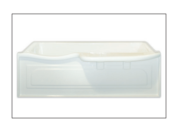
CHA 6034 TO 60"L × 32"W × 18.875"H Enclosure: N/A ACRYLIC TUB: Acrylic unit is only available in white