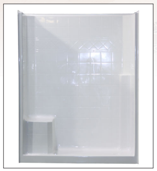
CHM 6039 SH IS Tile 60"L × 40"W × 76"H Enclosure: up to 55.75" × 70"

BEAUTIFUL NOW. FULLY APPRECIATED LATER. CHOOSE HOME FOR YOUR HOME.