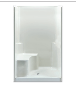
CHG 4837 SH 48"L × 37"W × 78"H Enclosure: up to 45.625" × 73"