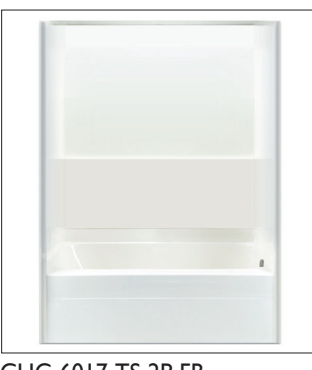
CHG 6017 TS 2P FB 60"L × 32.5"W × 78"H Enclosure: up to 56.5" × 61.5"