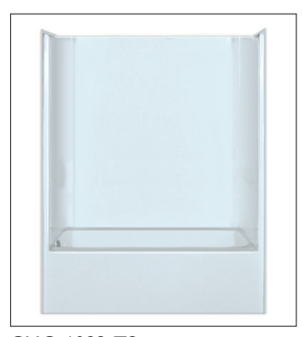
CHG 6092 TS 60"L × 32.25"W × 75.5"H Enclosure: N/A