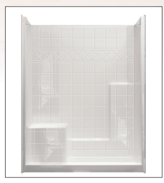
CHM 6032 SH 60"L × 33"W × 77"H Enclosure: up to 55.75" × 71"

The Choose Home Collection is designed to beautify your home today and allow for flexibility in the future. This thoughtful assortment of showers, tub showers, soaking tubs and sectional models each fit the criteria of the Choose Home theme - all of the design elements necessary to create bathing fixtures that are both beautiful and adaptable for future needs.