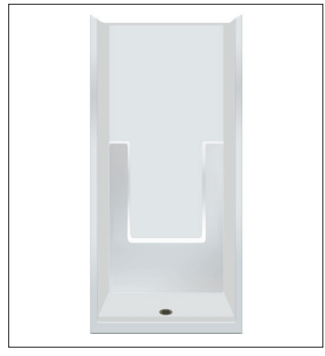
CHG 3636 SH 35.75"L × 37.25"W × 77.5"H Enclosure: up to 29.75" × 72"