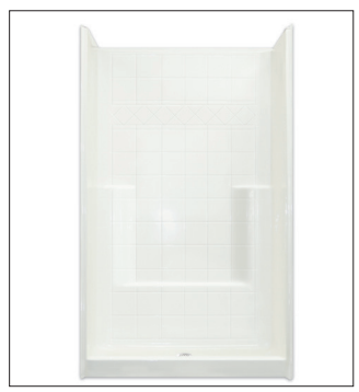
CHM 4242 SH 42"L × 42"W × 80"H Enclosure: up to 38" × 74"