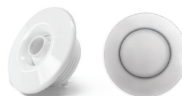
Direction adjustable jet and air push control

MAAX TIP: Adjust massage intensity by varying the air control dial.