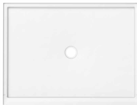
R-3850 ANSI-B Shower Pan