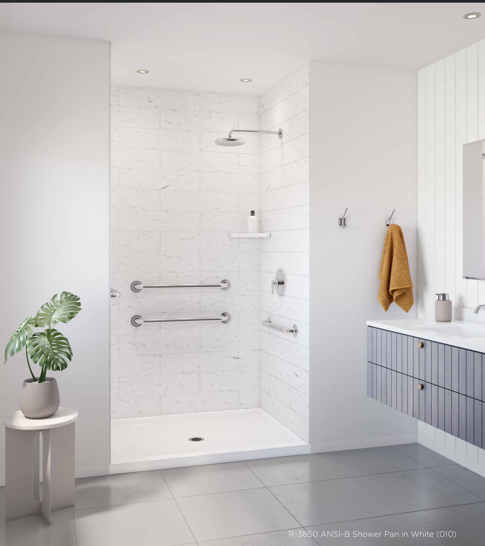
R-3850 ANSI-B Shower Pan in White (010)