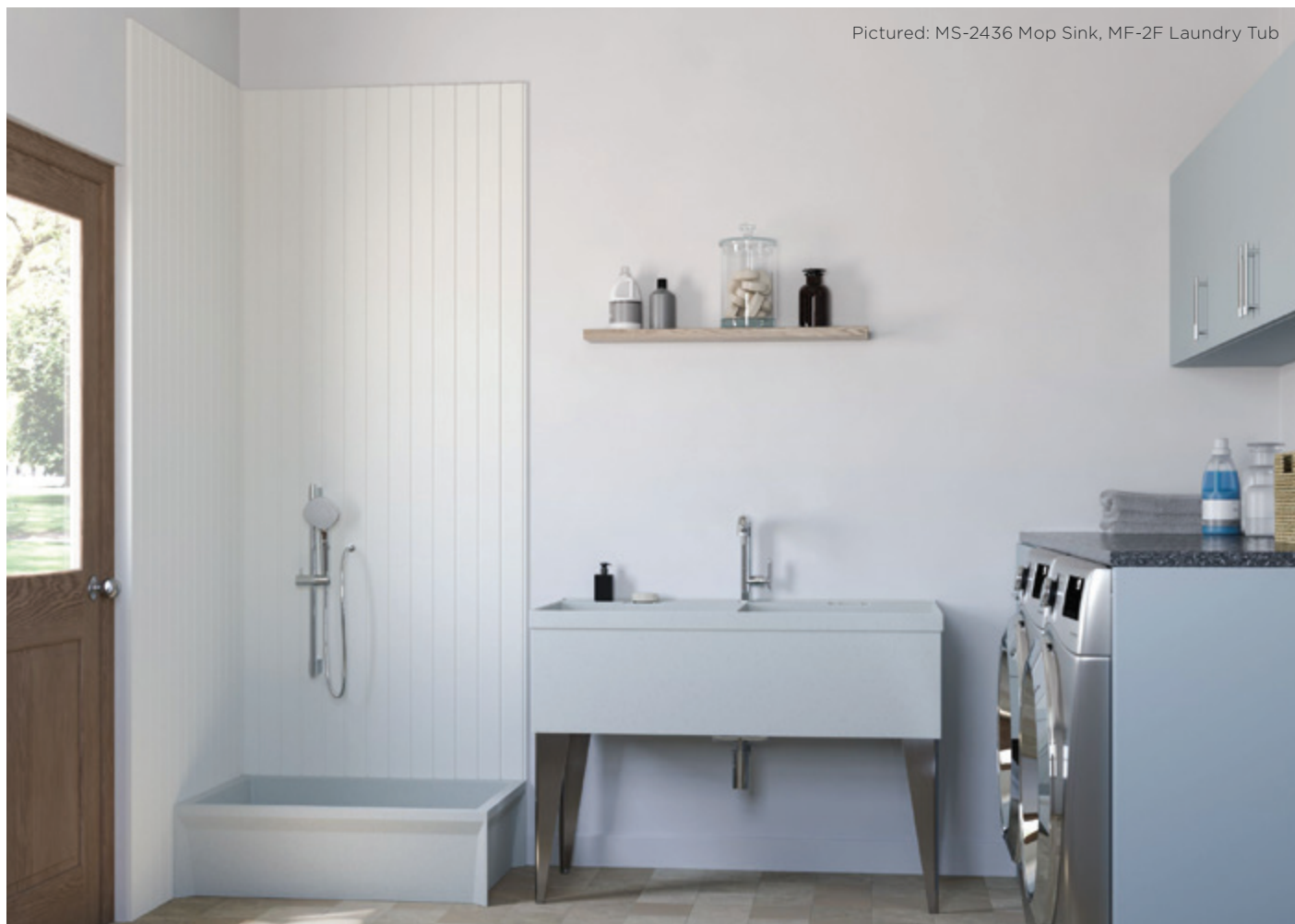
Pictured: MS-2436 Mop Sink, MF-2F Laundry Tub