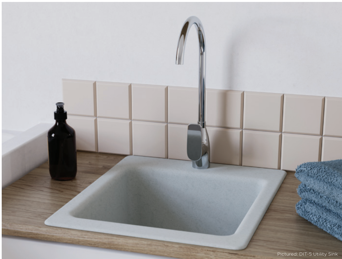
Pictured: DIT-S Utility Sink