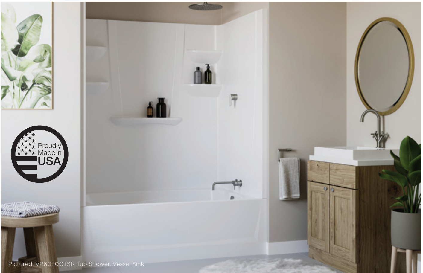
Pictured: VP6030CTSR Tub Shower, Vessel Sink