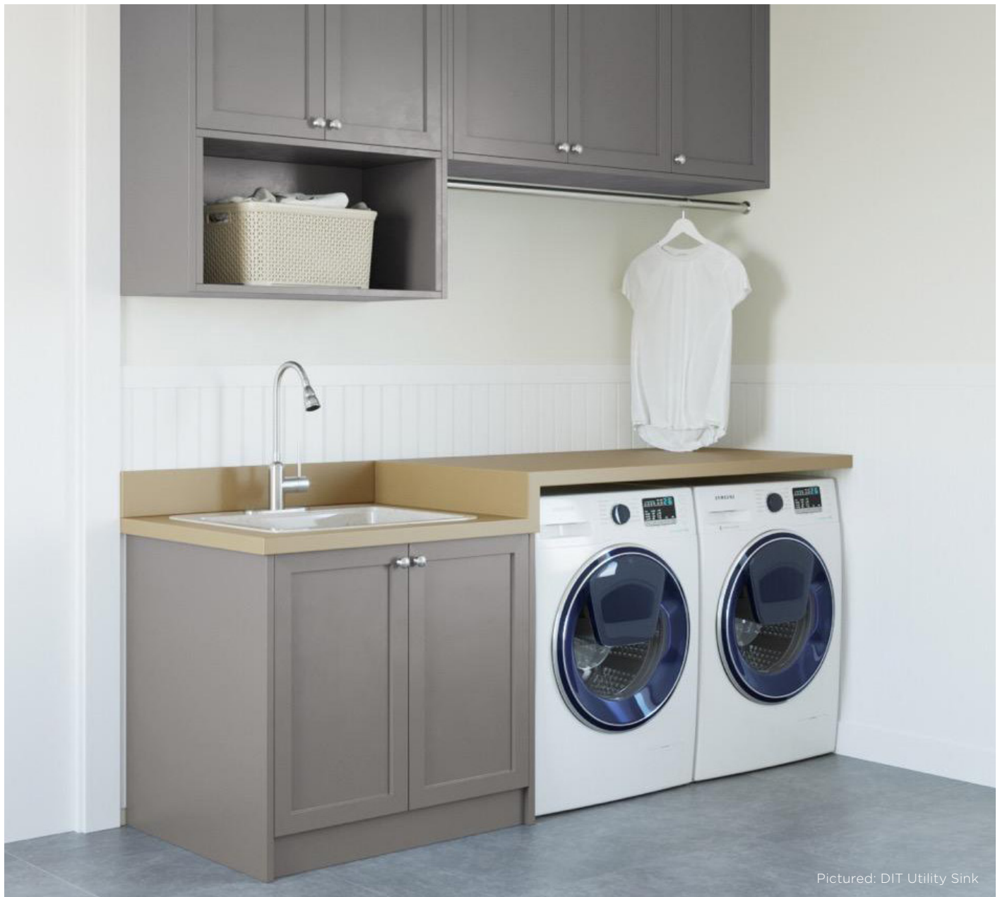
Pictured: DIT Utility Sink