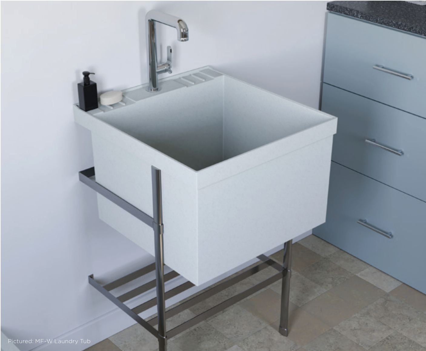
Pictured: MF-W Laundry Tub