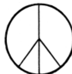
BAPS (1970): 28.