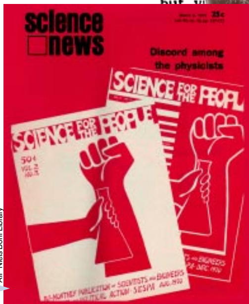
AIP Niels Bohr Library