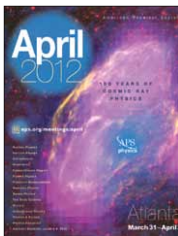
physics. Nobel laureate Samuel C.C. Ting from MIT will bring ATLANTA continued on page 6