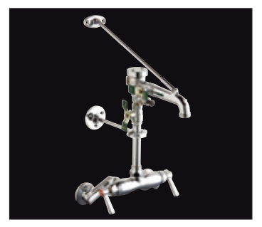
Model 445-PVBCP with continuous pressure vacuum breaker spout,

The spout incorporates a vacuum breaker with a spring-loaded poppet that helps prevent contaminated water from entering the water supply. The vacuum breaker must be installed vertically. Pressure must not exceed 150 psi.