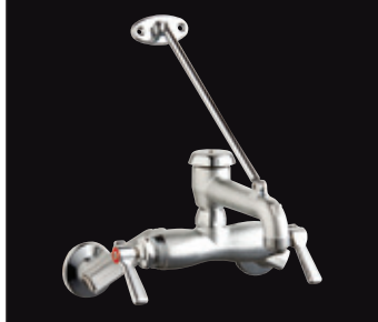
Model 445-VBRRCF with atmospheric vacuum breaker spout,