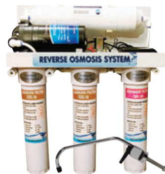
Booster Pump Model