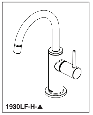
Submitted Model No.: Specific Features: