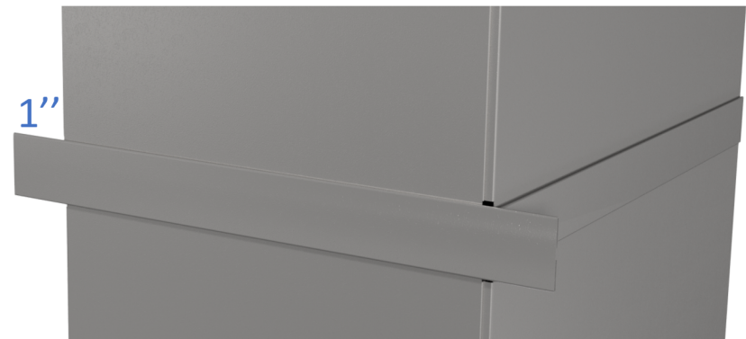
INSTALLATION VIEW 2