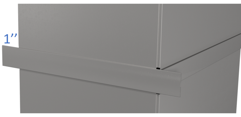
INSTALLATION VIEW 2