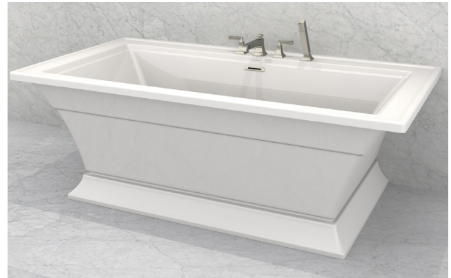
*Deck mount filler and overflow cover sold separately.

SEE REVERSE SIDE FOR ROUGHING-IN DIMENSIONS AND PRODUCT SPECIFICATIONS