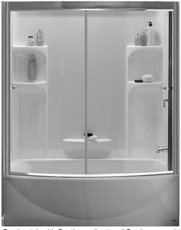
Ovation tub with Ovation wall set and Ovation curved bath door shown.

For color/finish availability and other faucet choices, please see the Product Selector and Pricing Guide.