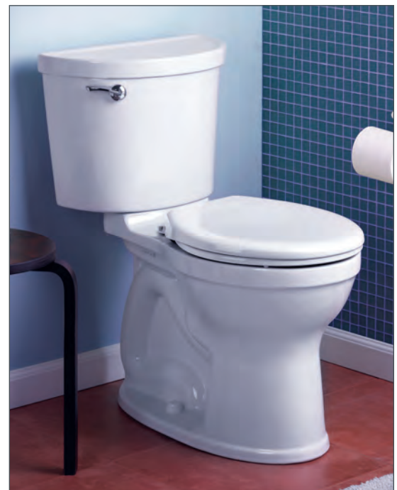
Pictured: 211BA Right Height Round Front Toilet Cover: 211AA Right Height Elongated Toilet