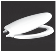
800 Series Elongated, Residential, Institutional, Commercial, Hotel/Motel