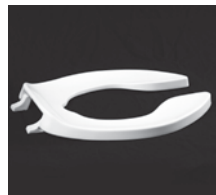
AMFR1500 Antimicro., Fire-Retardant, Elongated, Institutional, Comm., Heavy-Duty