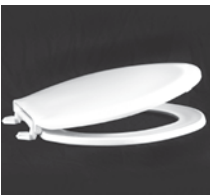
1600 Elongated Residential Economy