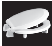
3L440 Regular Handicap Lift Seat