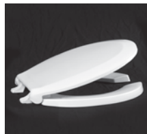
460 Regular Residential Inst. & Comm.