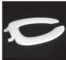
630 Elongated, Residential, Light-Duty Comm.