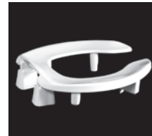
3L300 Regular Handicap Lift Seat