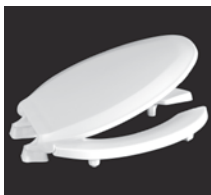
HL820 Elongated Handicap Lift Seat Extra Heavy-Duty