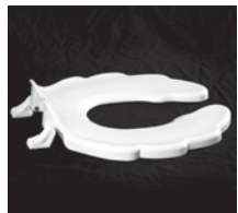
AM2300 Juvenile, Residential, Institutional, Comm.