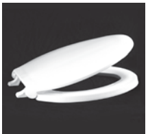
800 Elong. Res., Inst. & Comm. Hotel/Motel