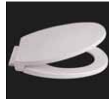
1400SC Round Residential Luxury