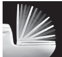
1700SC Elongated Residential Luxury