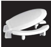
3L460 Regular Handicap Lift Seat Extra Heavy-Duty