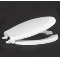
220 Regular Residential Light-Duty Comm.