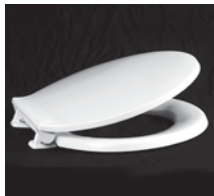
4000LC Reg.Lift & Clean Luxury Residential