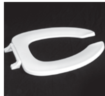
630 Elong. Residential Light-Duty Comm.