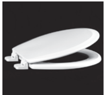
700 Regular Residential