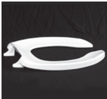
500 Series Elongated, Institutional, Commercial, Heavy-Duty