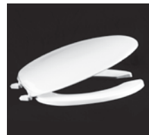
620 Elongated, Residential, Light-Duty Comm.