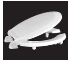
HL460 Regular Handicap Lift Seat Extra Heavy-Duty