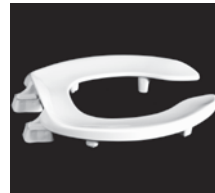
HL300 Regular Handicap Lift Seat