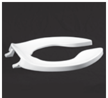
1500 Series Elongated, Institutional, Commercial Extra Heavy-Duty