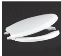
AMFR820 Antimicro., Fire-Retardant, Elongated, Residential, Institutional, Comm.