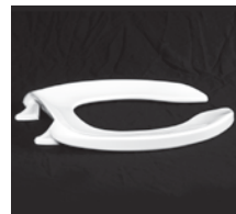
AM500 Antimicrobial, Elongated Commercial, Heavy-Duty