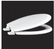
900 Elongated Residential