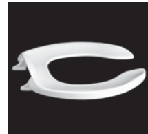
300 Series Regular, Institutional, Commercial, Heavy-Duty