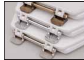
700 & 900 Models Now Available with Brush Nickel, Chrome & Brass Hinges