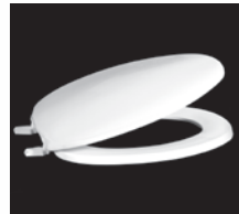
600 Elongated, Residential, Light-Duty Comm.