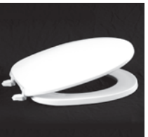
200 Regular Residential Light-Duty Comm.