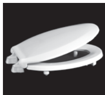
HL800 Elongated Handicap Lift Seat Extra Heavy-Duty