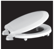
HL440 Regular Handicap Lift Seat