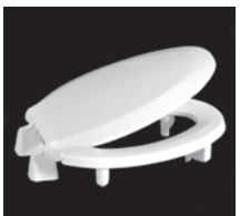
3L800 Elongated Handicap Lift Seat Extra Heavy-Duty