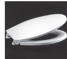
8000LC Elong.Lift & Clean Luxury Residential