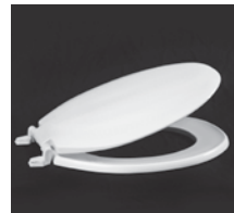
100 Regular Residential Economy, Canada Only