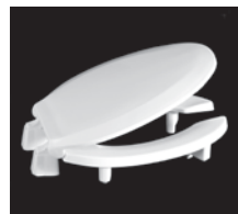
3L820 Elongated Handicap Lift Seat Extra Heavy-Duty