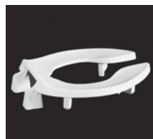
3L1500 Elong., Handicap Lift Seat Extra Heavy-Duty