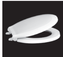
440 Series Regular, Residential, Institutional & Commercial