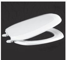
EMB 201 Reg., Eljer Res. Light-Duty Comm.