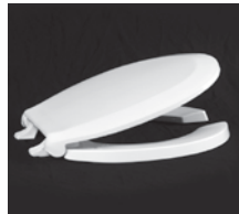
460 Series Regular, Residential, Institutional & Commercial