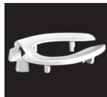
3L500 Elongated Handicap Lift Seat