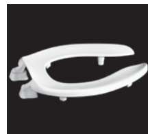
HL500 Elongated Handicap Lift Seat