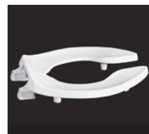
HL1500 Elong., Handicap Lift Seat Extra Heavy-Duty