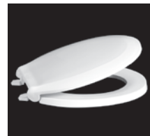
440 Regular Residential Inst. & Comm.