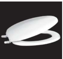
600 Elong. Residential Light-Duty Comm.