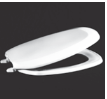
EMB 601 Elong. Eljer Light-Duty Comm.