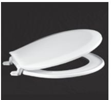
1200 Regular Residential Economy