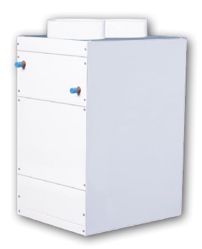
HE-P-240 Heating Unit (H)