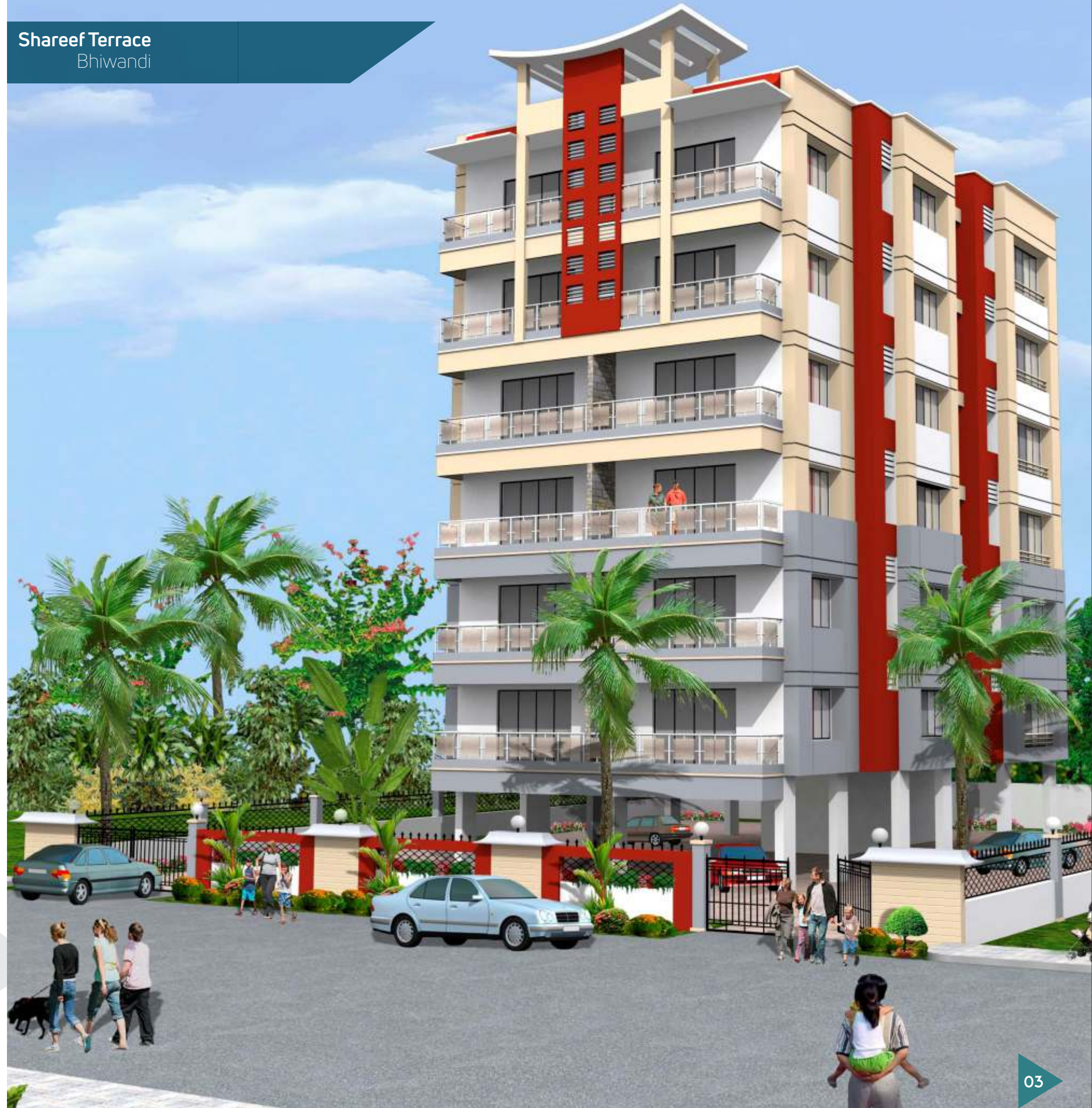
Shareef Terrace Bhiwandi

We hope that this portfolio will have a positive impact on you and will cement our partnership for years to come.