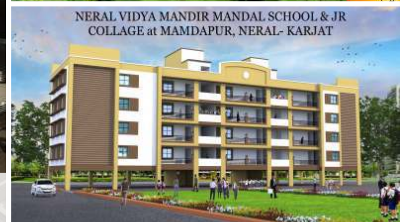
NERAL VIDYA MANDIR MANDAL SCHOOL & JR COLLEGE at MAMDAPUR, NERAL- KARJAT