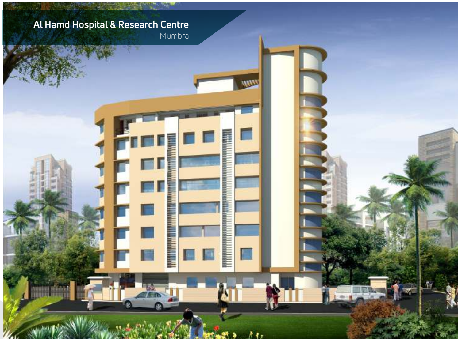
Al Hamd Hospital & Research Centre Mumbra