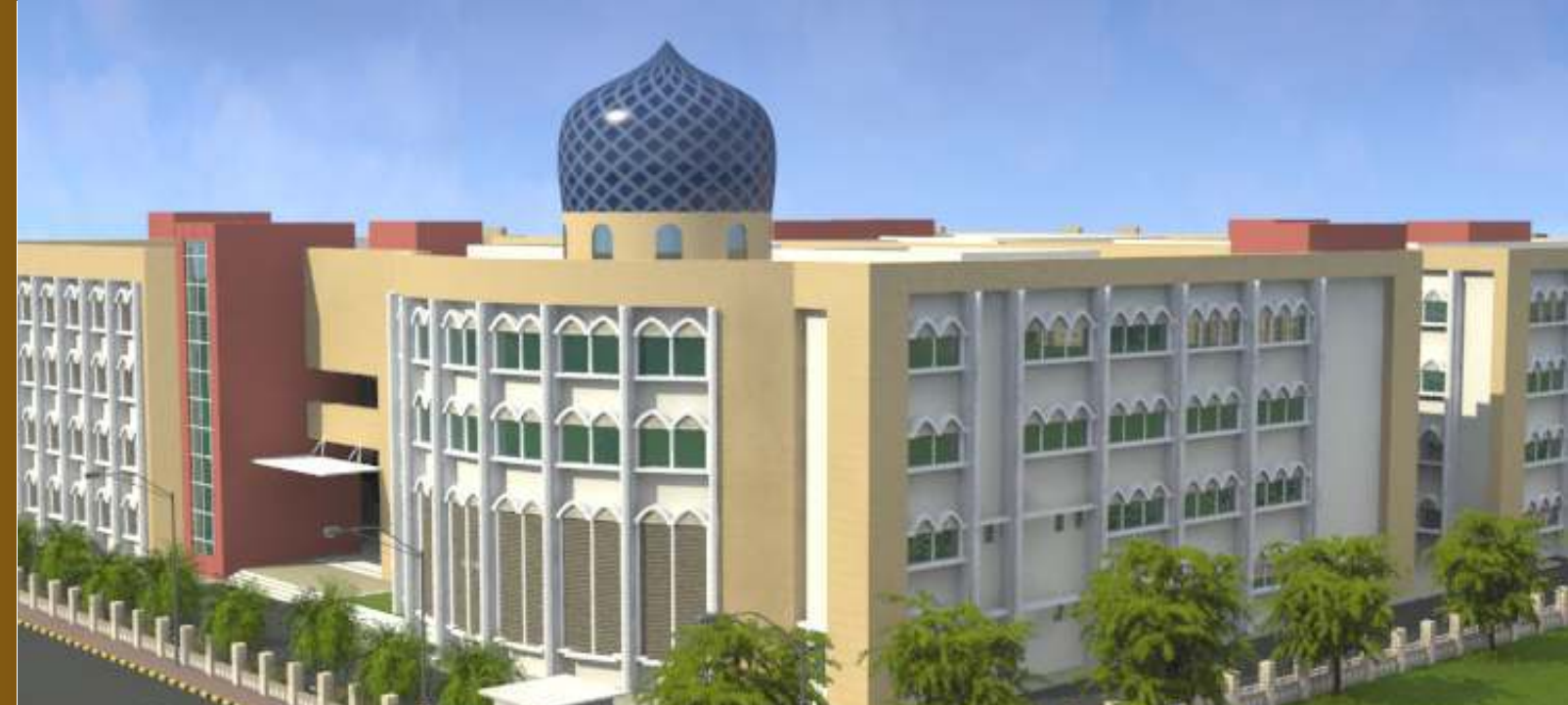
Anjuman Islam's Kalsekar Technical Campus-New Panvel

Regd. Address : 63, Bhusar Mohalla, Opp. Hindustani Masjid, Bhiwandi-421302, Thane. Office : R. N. Complex, Gr. Floor, S. No. 9, Millat Nagar -1, Mumbai Nashik Highway, Bhiwandi-421302, Thane. Tel. : 91 2522 656500 email : unityconstructs@gmail.com