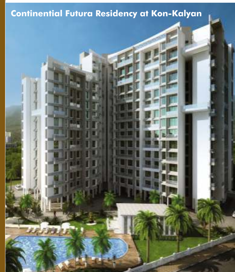
1, 1.5 & 2 BHK SPASIOUS RESIDENCES OF 4 MAGNIFICENT TOWERS

Maharera Registration No. P51700015939 ( https://maharera.mahaonline.gov.in ) Project Approved by MMRDA