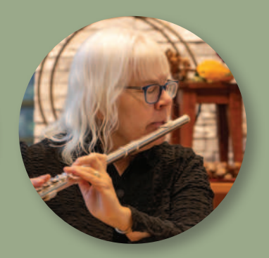
3.7M DOLLARS economic impact to local communities