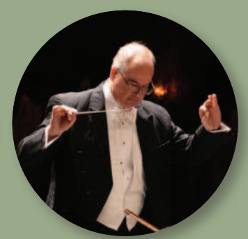
200 PERFORMANCES held throughout the Corridor