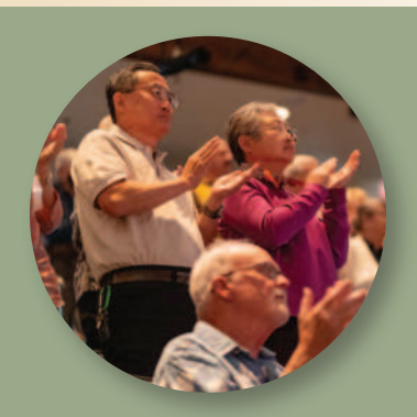
50,000 INDIVIDUALS experience music by Orchestra Iowa

A long-standing community partner, Orchestra Iowa is committed to delivering exceptional, diverse, and accessible musical experiences with impact throughout Eastern Iowa.