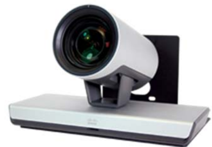
Cisco Precision 60 Camera (Camera not included with wall mount)