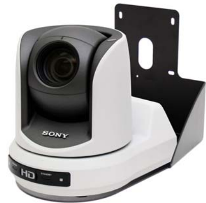
Figure 1: (top) Quick-Connect CCU 1 RU rack mount interface; (bottom) WallVIEW PRO Z330 System with Camera, EZIM and Wall Mount

Overall, the WallVIEW CCU Z330 is superb for a wide range of high definition shooting applications. It is also highly suitable for applications where adjusting the color and brightness levels of one or multiple cameras is critical, such as houses of worship, corporate boardrooms, live event production and distance-learning applications.