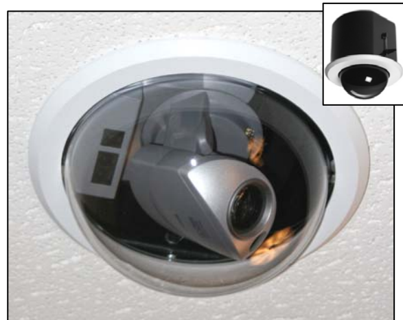
Figure 1: DomeVIEW Flush Mount Dome System shown with Canon VC-C50iR camera and EZCamera Cabling Shoe mounted in the enclosure (Upper Right: Flush Mount Dome shown with plenum rated metal back can and smoke tinted bubble - clear is standard).

The Domes are formed from optical grade polycarbonate and are available in clear (standard) or smoked tint (optional). The DomeVIEW Flush Mount Domes are excellent values that are high quality, attractive and durable solutions for indoor security applications.