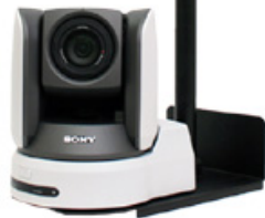
535-2000-294 For Sony BRC Series Cameras