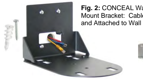
Fig. 2: CONCEAL Wall Mount Bracket: Cabled

Fig. 3: The Vaddio HD Camera aligned and attached to the CONCEAL Wall Mount Bracket using the provided 3/8" x 1/4"-20 screws - See Step 2.