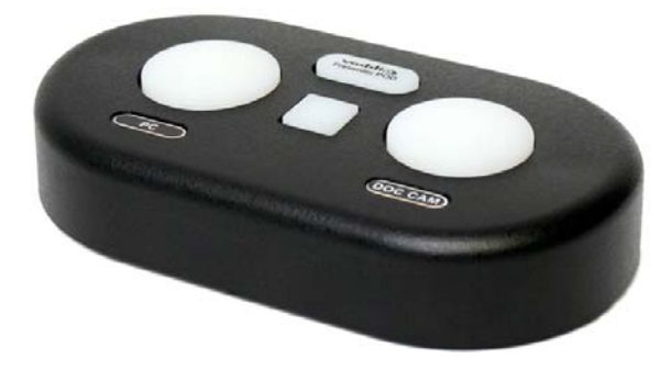
Figure 1: PresenterPOD (top and front) showing four (4) back-lit trigger buttons, PresenterPOD Interface front panel (bottom)

Two (2) large round buttons located on the PresenterPod offer the presenter flexible control over the automated content on other presets and other necessary content sources. A third small square button is available for PIP On/Off adjustments if PIP is stored within any of the presets activated by the PresenterPOD. Even the Logo button can be used as a trigger.