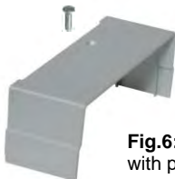
Fig.6: CONCEAL Rear Camera Cover with provided 6-32 Flat Head Screw

After successful testing of the camera, install the Conceal Rear Camera Cover on the CONCEAL Mounting Bracket with the supplied screw (see Fig. 6 and 7). Align the rear tab on the back of the mount with the screw and carefully tighten the screw. Please do not over tighten the screw.