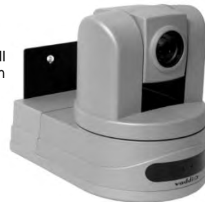
Fig. 7: Completed CONCEAL Wall Mount Camera Bracket Installation