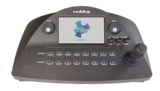
image settings to presets to dynamic positioning from a single device. Use the integrated H.264 decoder to view the live IP stream from the currently selected IP camera from the courtesy HDMI output.

Precision control for up to 16 PTZ cameras at once, including up to 8 connected locally via RS-232. Instantly access all PTZ camera related functions ranging from