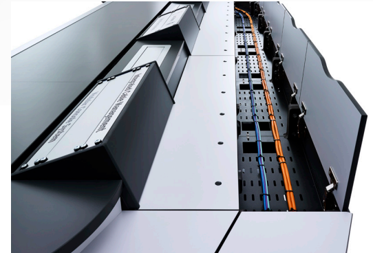
INTEGRATED CABLE MANAGEMENT SYSTEM