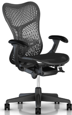
MIRRA II CHAIR