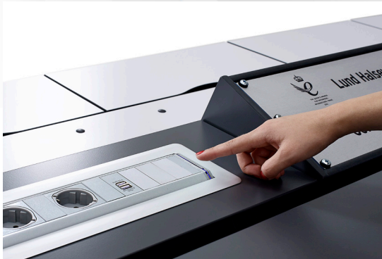
MODULAR DESK MOUNTED 19" EQUIPMENT PODS