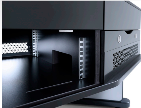
INTERNAL RACK MOUNTING FACILITY