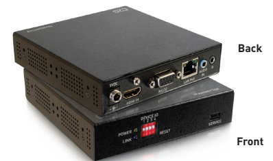
29975 HDMI over IP Encoder - 4K 30Hz