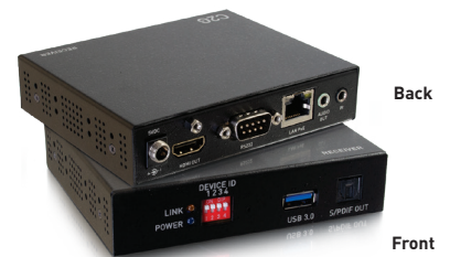
29976 HDMI over IP Decoder - 4K 60Hz