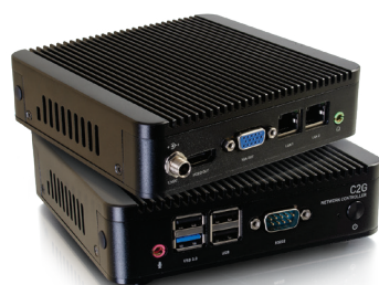
29977 Network Controller for HDMI over IP