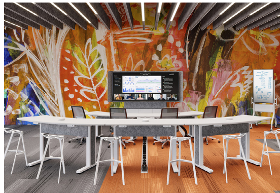
TREND: TECHNOLOGY FOR HYBRID & FLEXIBLE COLLABORATION