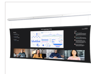
PROJECTION SCREEN WITH CABLE DROP