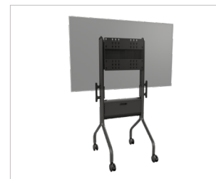
LARGE MANUAL HEIGHT-ADJUSTABLE AV CART

Fewer chairs in every conference room will inevitably lead to meetings in otherwise common spaces. Occupancy limitations will also further the trend of remote participants. Imagine being required to stay home on the day of a big meeting because the largest conference room only holds half as many people as it used to. The physical space and remote engagement challenges are met by making every office space as multifunctional and AV-friendly as possible. Expect to see the use of mobile carts with audio/video equipment for conferencing anywhere to become the most flexible, cost-effective way to collaborate in any space.