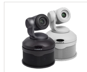
CONFERENCE ROOM CAMERA SYSTEM