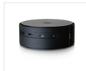
CONFERENCE ROOM VIDEO HUB