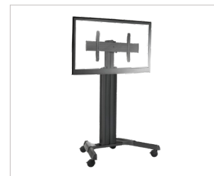
HEIGHT-ADJUSTABLE MOBILE CARTS