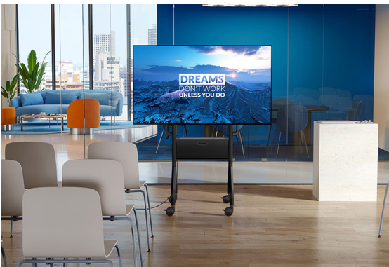
TREND: FLEXIBLE MEETING SPACES

Returning to work means returning to in-person meetings, but the spaces where people meet is going to look much different. Traditional conference and collaboration rooms will undoubtedly have fewer chairs, new health and safety protocols, and social distancing requirements. This change coupled with the hybrid workforce trend that is likely to continue indefinitely means it's time to start rethinking the spaces where people conference and collaborate. Legrand | AV has identified three trends that are likely to shape the way integrators and designers approach conferencing and collaboration spaces in the next three to five years.