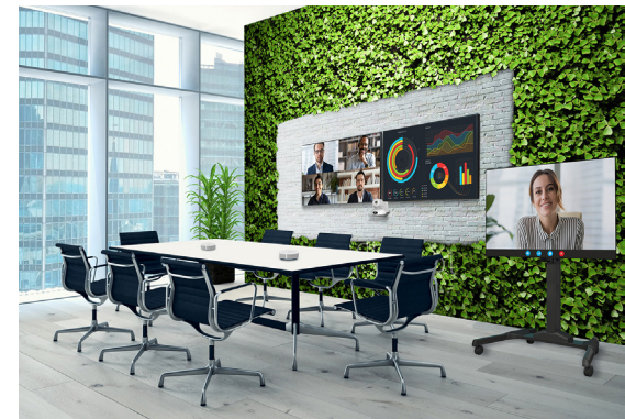
TREND: ENHANCED REMOTE USER EXPERIENCE