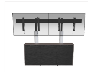
CREDENZA & DISPLAY MOUNTS