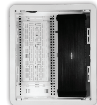
17" models are compatible with Samsung One Connect Box