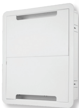
Flush, Wi-Fi transparent, removable cover with venting and cable access. 17" models include split cover that supports removal even when partially covered