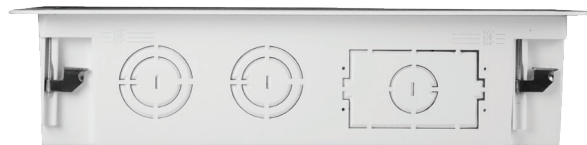
Top power receptacle and cable management knockouts