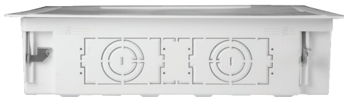
Bottom power receptacle and cable management knockouts