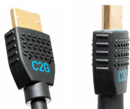
Integrated Finger Grips