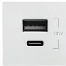
15W Combo USB A/C Port