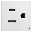
15A Tamper-Resistant Rotated Outlet

Available with power, charging, and data cubes. Specific conditions apply when configuring, please consult your Legrand sales representative on potential configuration options and availability.