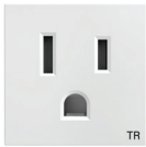
15A Tamper-Resistant Outlet