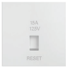
Circuit Breaker (used with 4 or more outlets)