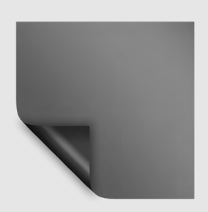
Parallax Stratos 1.0

Parallax® Stratos 1.0 is a front projection screen surface designed for high resolution up to 4K. Suitable for laser projectors with standard throw lenses, its dark gray appearance enhances image color and contrast, and is available in sizes up to 16' high seamless.