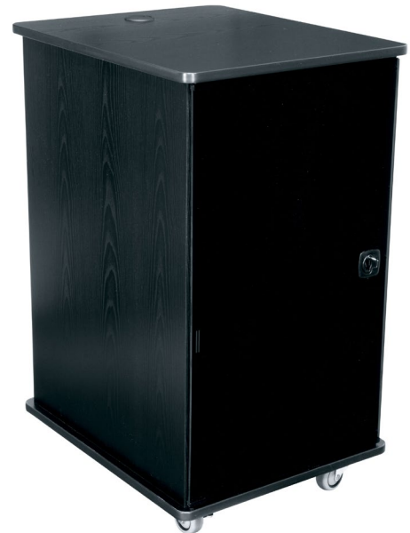
Mobile Furniture Rack