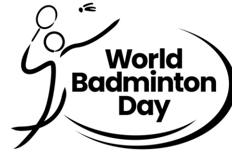
Monochrome – black