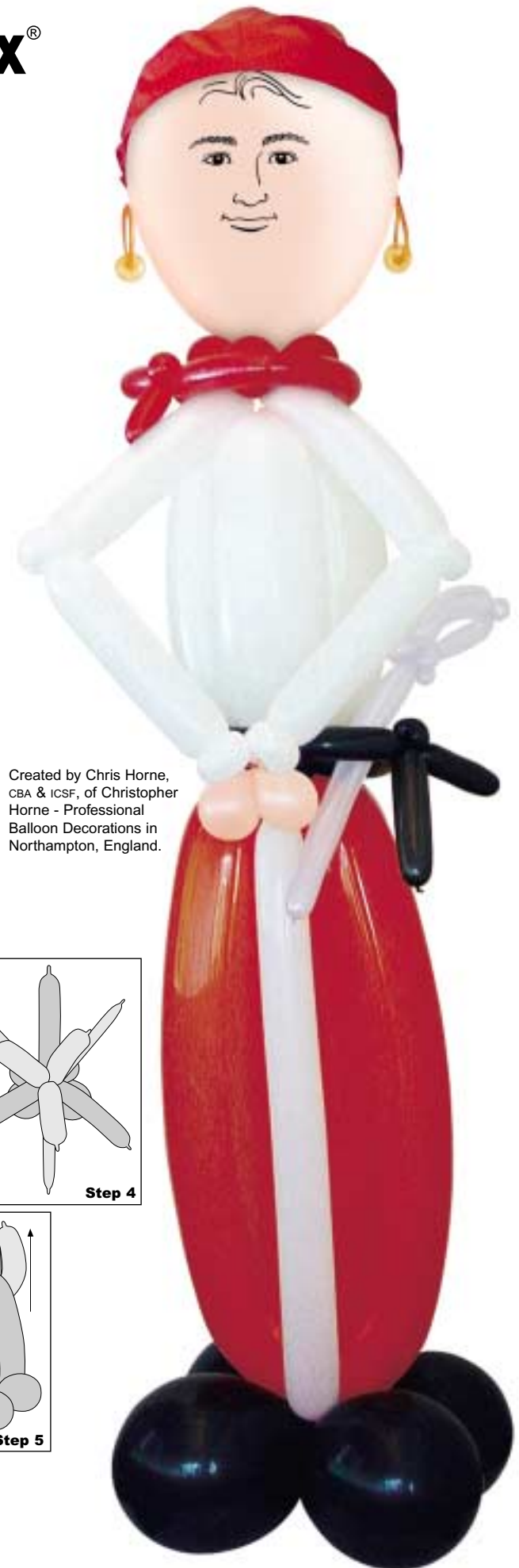
Created by Chris Horne, CBA & ICSF, of Christopher Horne - Professional Balloon Decorations in Northampton, England.

7. Air inflate the 16" "Young Man Face" balloon. Qualatex latex balloons naturally inflate to a pleasing teardrop shape. To ensure this shape, place the neck roll slightly onto the inflation tip. Slowly fill the balloon, until it begins to taper at the bottom and form a "chin." NOTE: Avoid holding the balloon neck high up, as it will result in a "basketball-shaped" head. Tie the "head" to the knot on the White 646Q cluster.